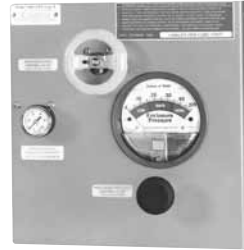
LPS Style (Less Pressure Switch)