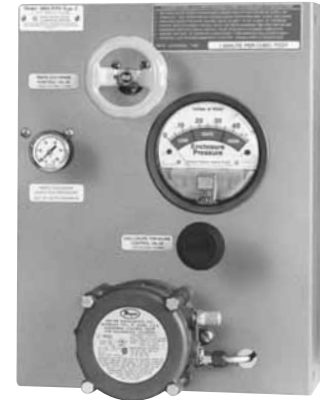
WPS/WPSA Style (With Pressure Switch)